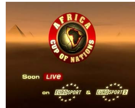
CAN Promo spot